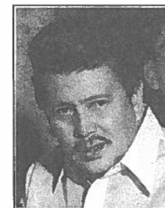
President Joseph Estrada

nine opponents was not devoid of drama worthy of the movies he used to star in. Although he was vice president when he made his intentions clear that he wanted to occupy Malacañang, he belonged to a very small party, the Partido ng Masang Pilipino which he had only one member in Congress.