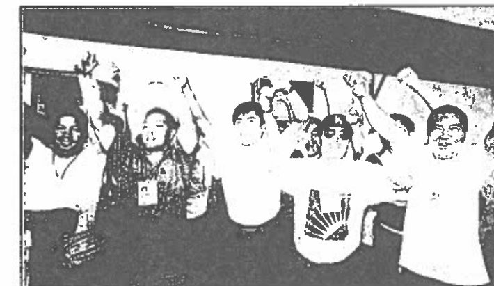
The Philippine Airline union members thumb down the suspension of their collective bargaining agreement (CBA).

nine opponents was not devoid of drama worthy of the movies he used to star in. Although he was vice president when he made his intentions clear that he wanted to occupy Malacañang, he belonged to a very small party, the Partido ng Masang Pilipino which he had only one member in Congress.