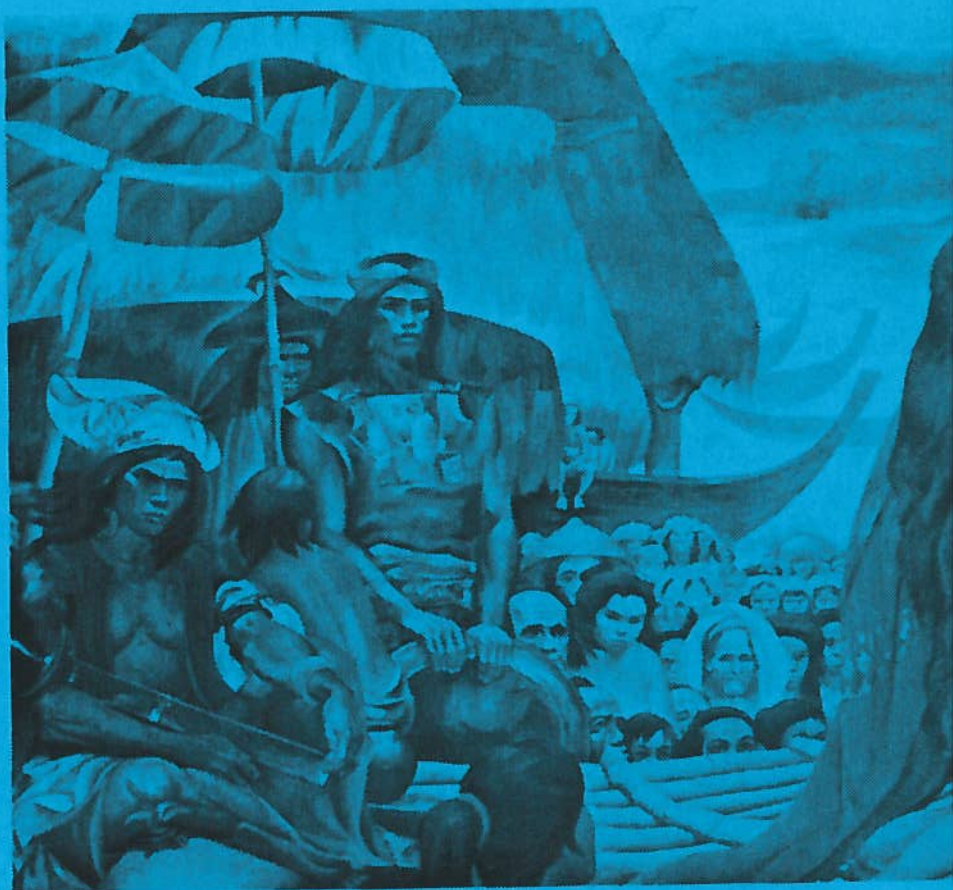
Carlos Francisco, Introduction of the First Christian Image , 1965, NMG No. 315