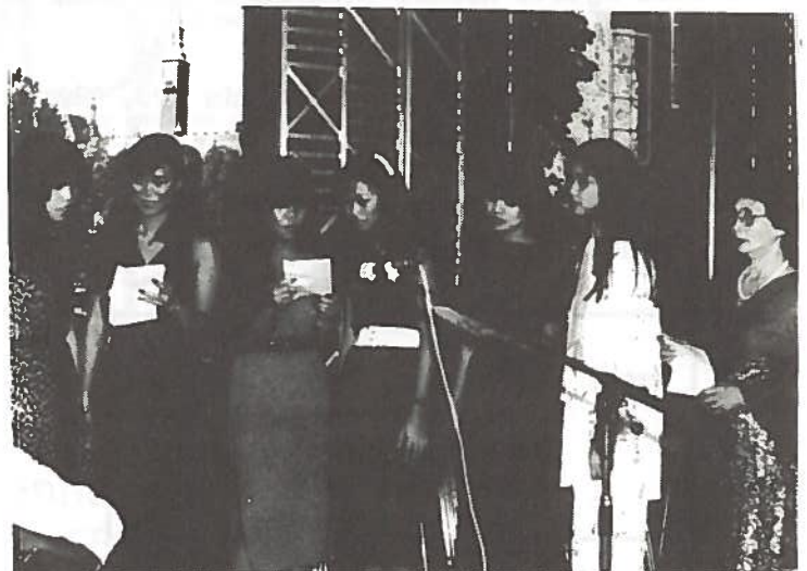
The ladies in the singing group — in action