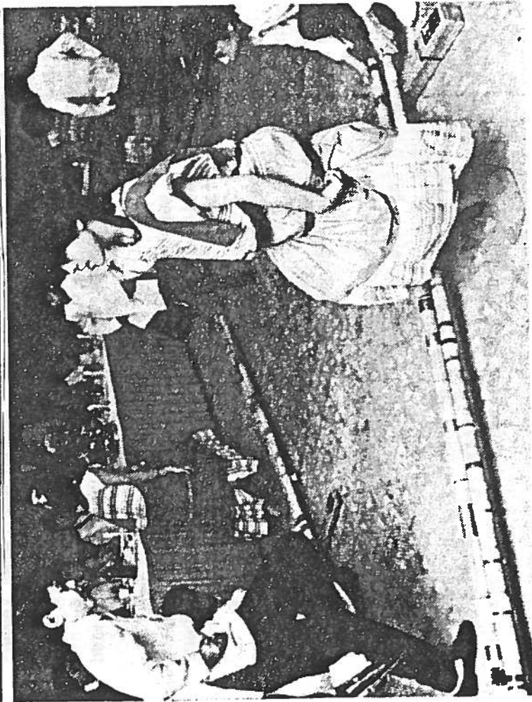
Den dygtige filipinske dansetrup viste bl.a. national dansen Tinikling.